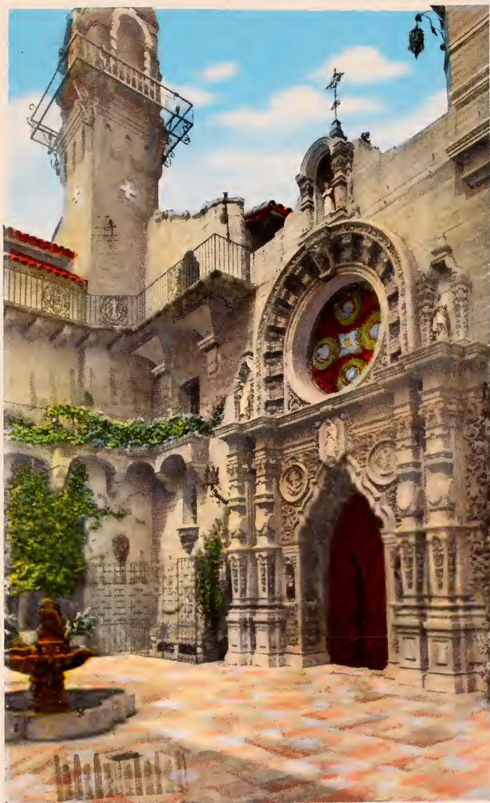
ST. FRANCIS CHAPEL, MISSION INN, RIVERSIDE, CALIFORNIA